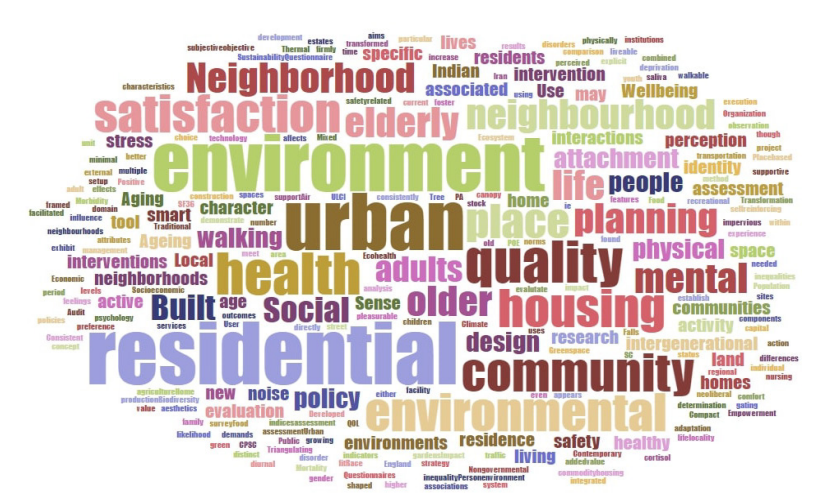
Figure 1. Weighted focus cloud generated by Jason Davies word cloud generator

The physical, psychological, environmental, and experiential factors of engagement, such as pleasure, satisfaction, play, and user interaction, are considered in research on identifying the characteristics of neighborhood environments more focusing on the livable environment for this demographic age group, particularly the elderly (Miyazaki & Ando, 2020). In order to design smart living spaces, it is important to keep in mind the cognitive and emotional needs of older folks while incorporating new digital technologies (Lee & Kim, 2020). Designing modern residential areas around "Livable Neighborhoods" encourages healthy behaviors and outcomes, such as commuting and leisure biking, and creates more cohesive communities (Hooper et al., 2020). In addition, the research found that people have established a new socialbased understanding and spatial-knowledge structure, allowing them to collaborate to become a society with a high social capital